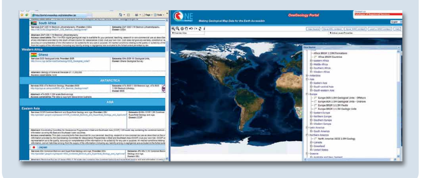
image), improved listing of countries and regions (right of image), including states, provinces and countries as well as improved access compatibility through numerous web browsers including Firefox 3, Opera, IE6 and 7, Safari and Chrome. All available at www.onegeology.org/portal/home.html

The new version of the OneGeology portal was released in June 2009. This version displays a much improved 'catalogue of registered services' (left of