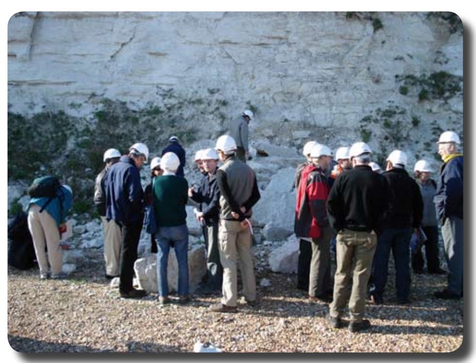
OneGeology Workshop participants near Beach Head, Sussex, UK

The hard work was interspersed with some fun as participants enjoyed a whisky tasting evening, a geo-quiz and an evening of traditional English Morris Dancing!